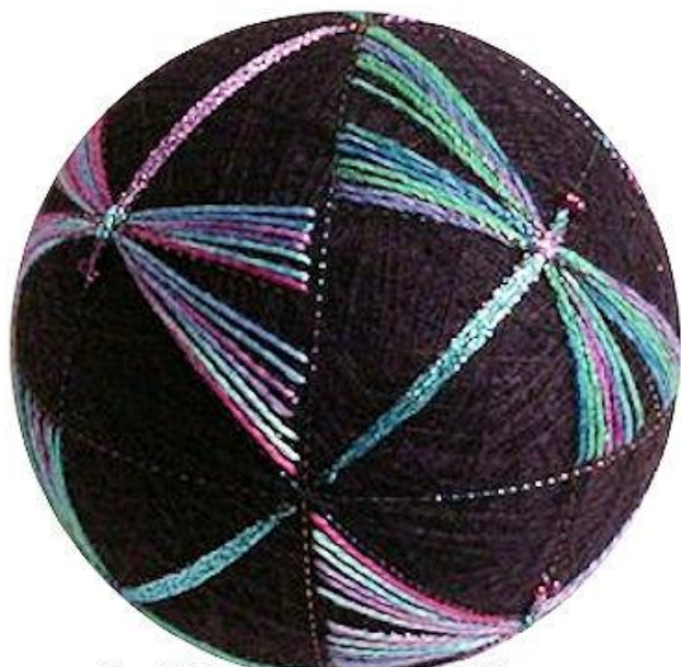
KarenMcP., G.Thompson/TemariKai 2014

Materials: 23-25 cm circum mari, wrapped in color of your choice