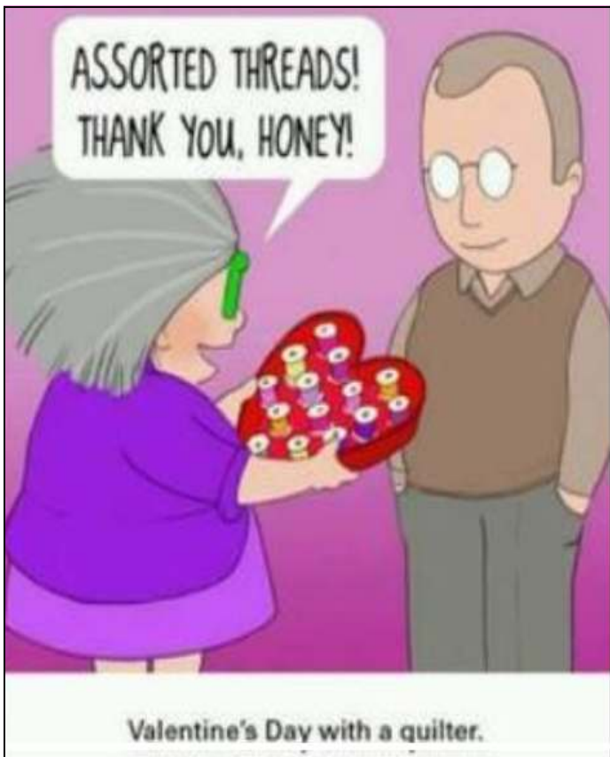
Valentine's Day with a quilter.