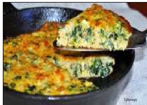
Frittata with broccoli or spinach added. You have many options!