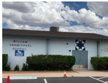
Carmichael Elementary School, 701 N Carmichael