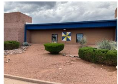
Huachuca Mountain Elementary School, 3228 St Andrews Dr

New guidelines for making backs for quilt tops: please make the backing at least 5" longer on each of the top & bottom edges and 4" on each side. This allows for ease in loading the backing without the quilter having to add an extra leader.