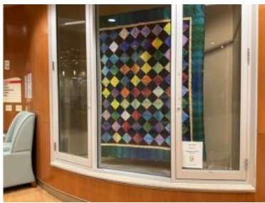
Canyon Vista Medical Center display