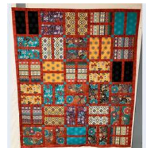
Photo of March Quilt for Blue Moon