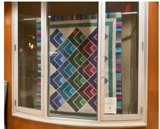
New Hospital Display

We send get well wishes to Jan B as she recuperates from a car accident.