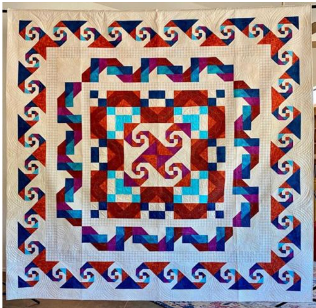
2021 Opportunity Quilt